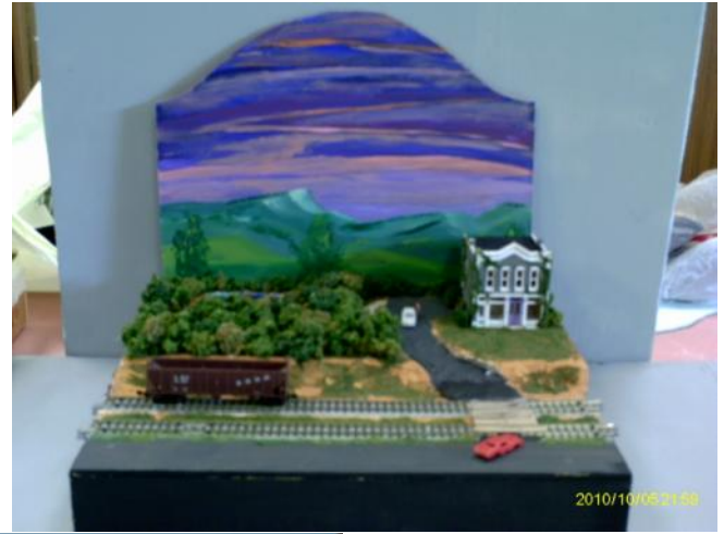
A sample of recently