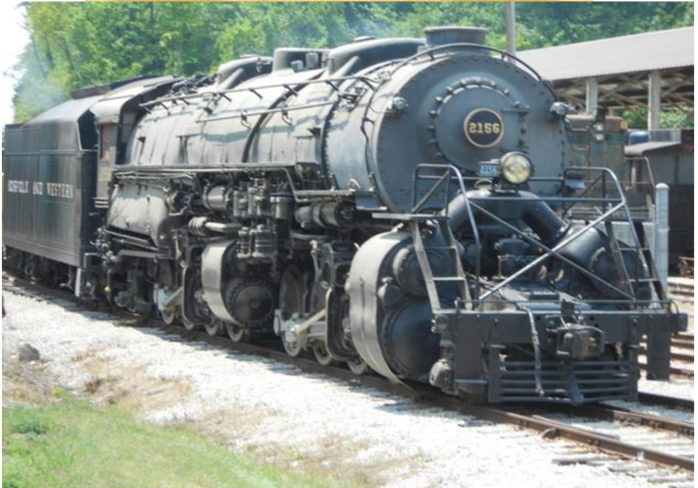
From the real world: N&W Y-class 2156 is ready to get underway from St. Louis to Roanoke. The trip will bring the locomotive back to N&W property for restoration.