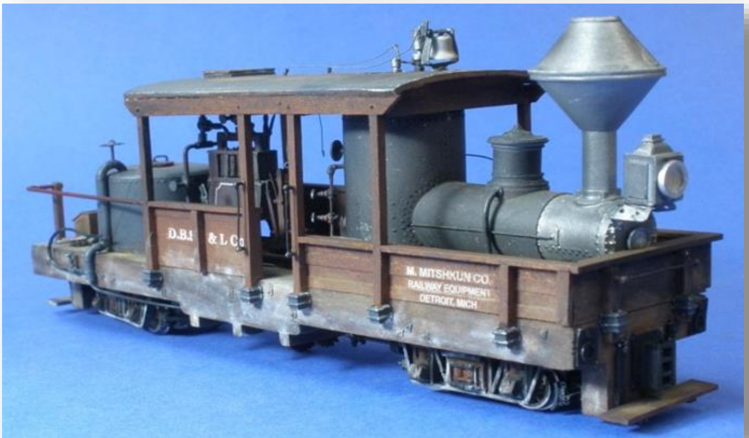
Joe Norris' Scratch-Built On30 Climax.

Please keep us informed of changes in your address, phone number or email address.