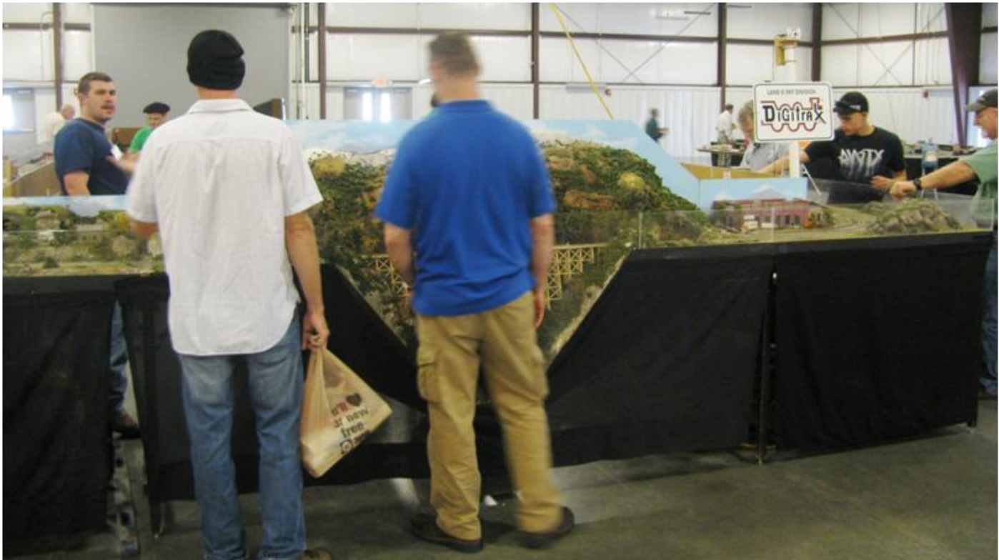
Our module team at Autumn Rails on October 12th & 13th, 2013

Please keep us informed of changes in your address, phone number or email address.