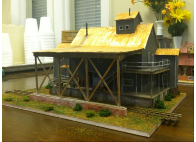
Some of Jack Mershon's building on display at our last meeting