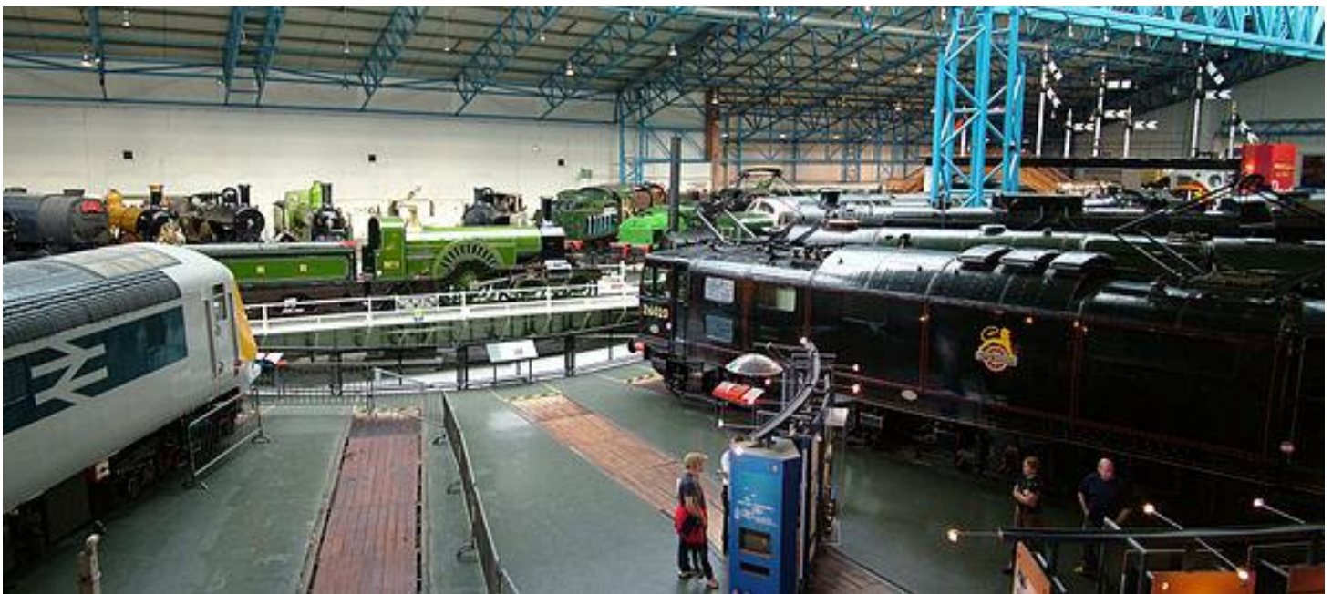
A panorama of locomotives arranged around the turntable in the Great Hall

It is the largest museum of its type in Britain (the largest in the world in terms of floor area of exhibition buildings is La Cité du Train in the French town of Mulhouse, although this attracts far fewer visitors than the NRM). It also has more visitors than any other British museum outside London, attracting nearly a million visitors a year. The NRM was established on its present site, the former York North locomotive depot, in 1975, when it took over the former British Railways collection.