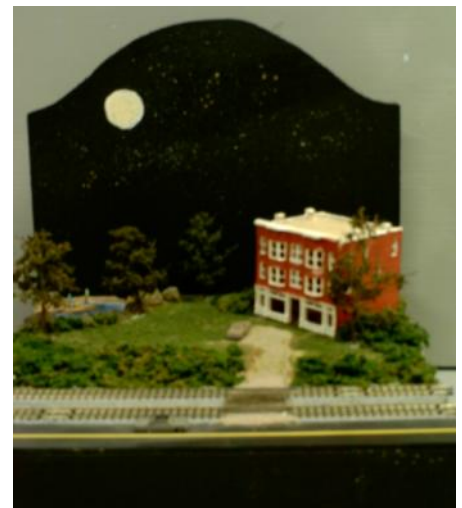
Star Watch by Melisca

These are some of the modules made in the last few months. Come down and join the fun. No experience required, just some problem solving. Learn from helping them get to their finished module!