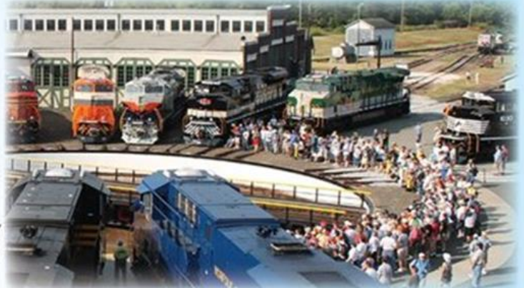
Photo from 2012 Norfolk Southern Heritage Unit Family Portrait

View the engines with special nighttime photo lighting around the Bob Julian Roundhouse. Enjoy special arrangements and pairings of the locomotives that will change each night.