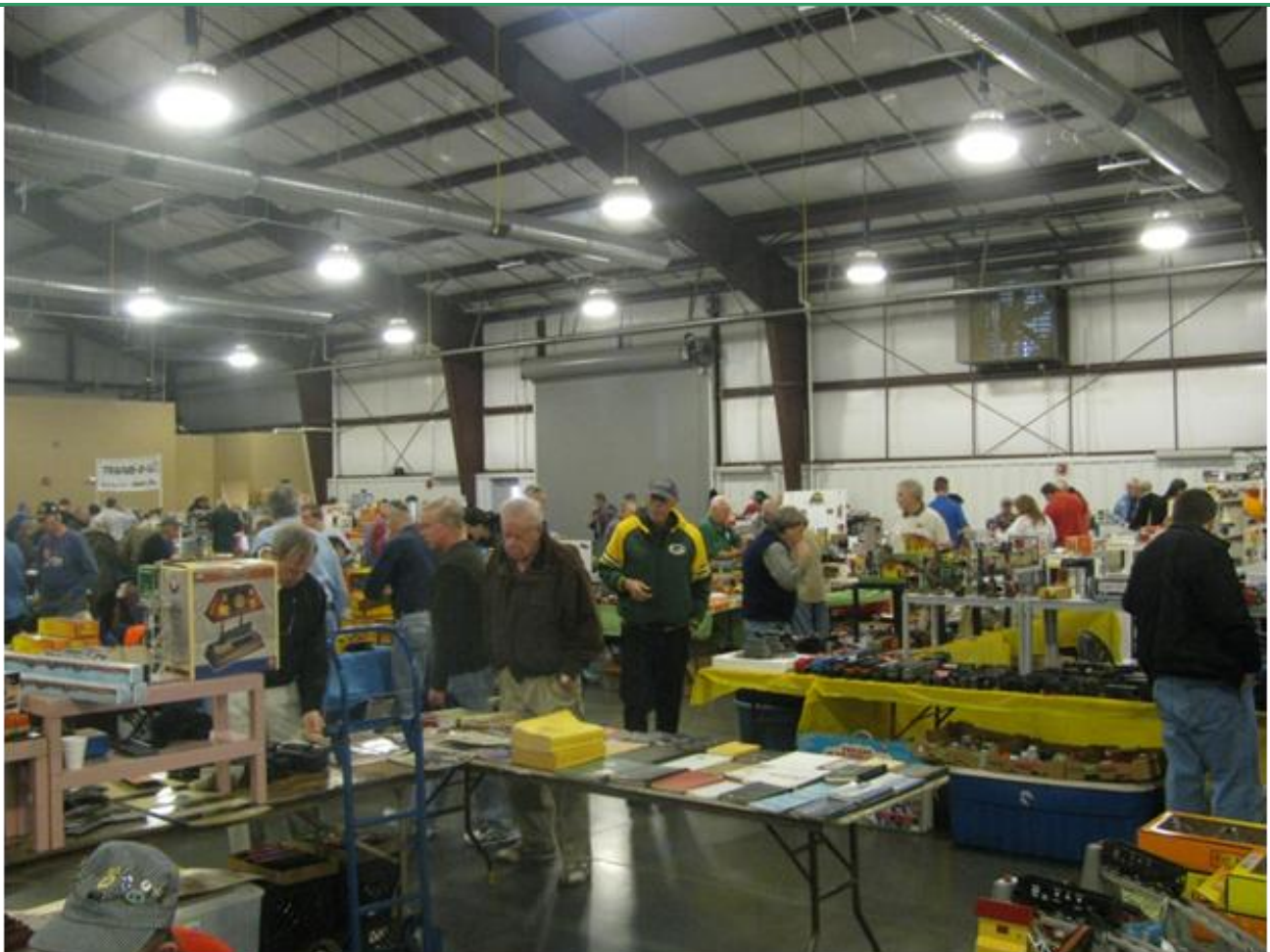
People enjoying our train show

Please keep us informed of changes in your address, phone number or email address.