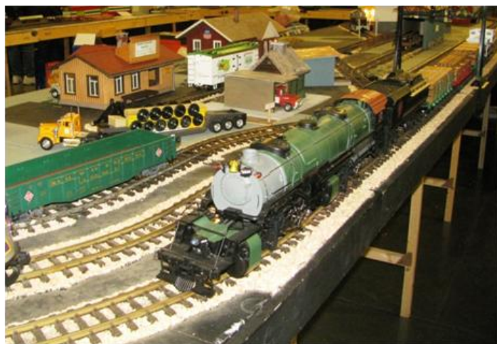
Piedmont Garden G Scale modules