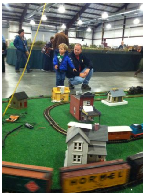
Some one admiring Thomas and other trains in the layout area.