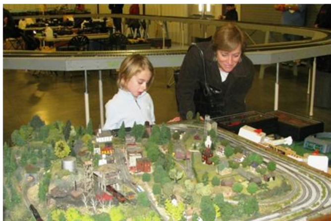
Looking at the enormous Z-scale layout