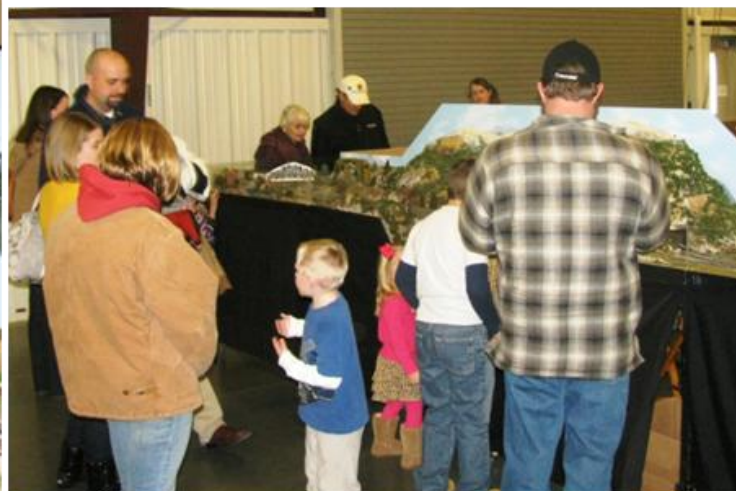
People enjoying our LOST RR