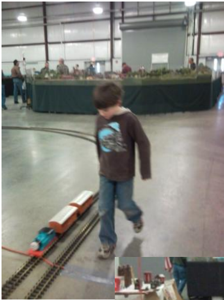
Kids follow Thomas ® the Tank Engine anywhere