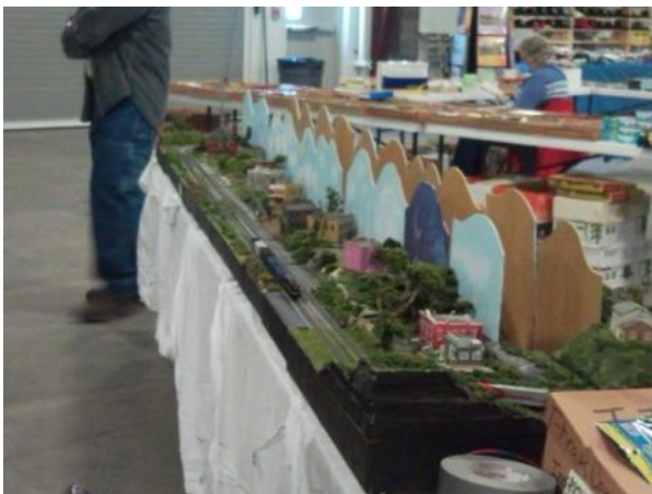
Eliada Home kid's T-Trak modules. Hope you saw some of their handiwork & imagination that we help spark!