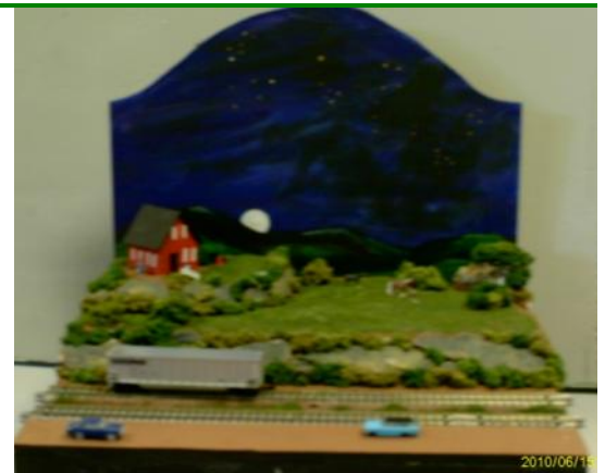
"Moon Rise" by Filesa