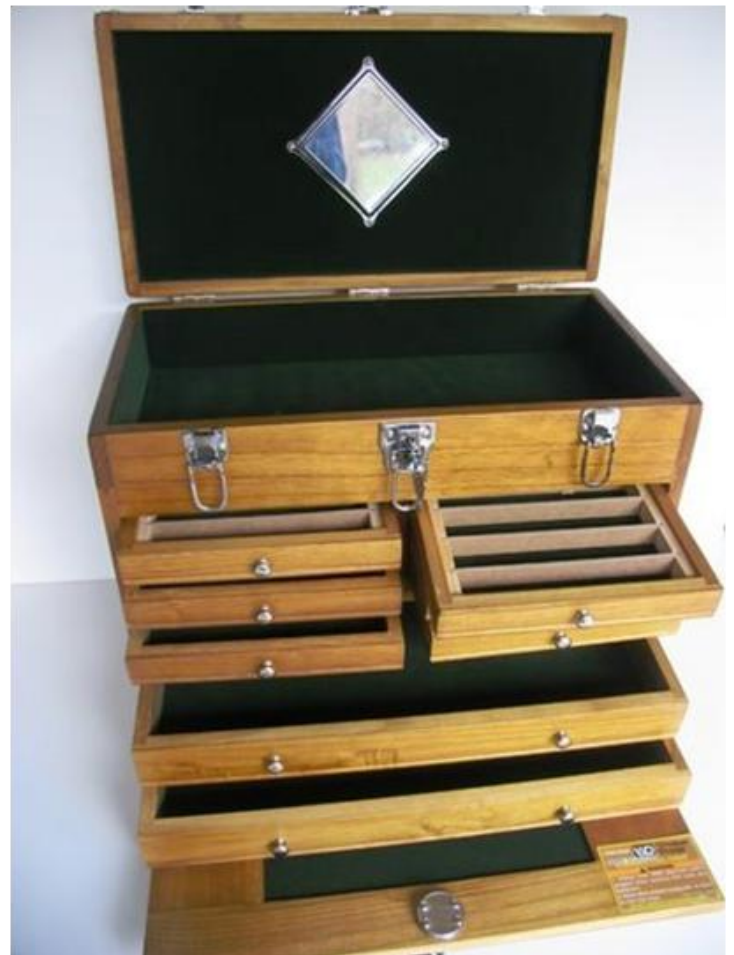
Our raffle prize to be given away at the Train Show.