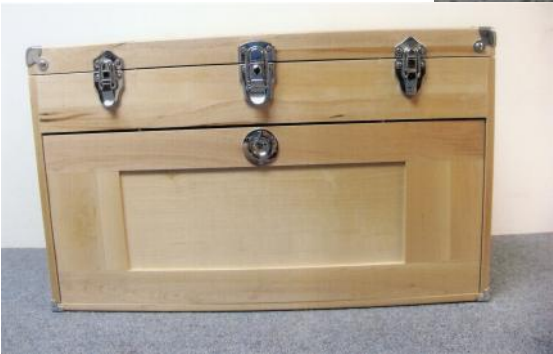
Machinist Tool Box